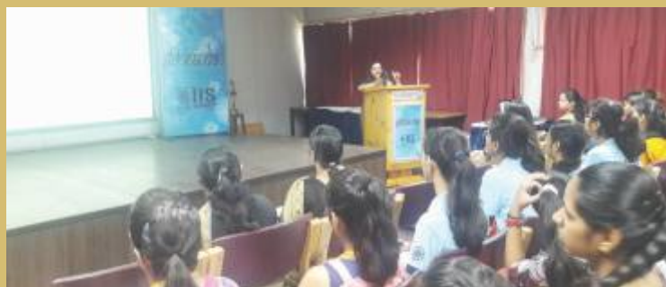
Dept. of Commerce - 16 July 2018