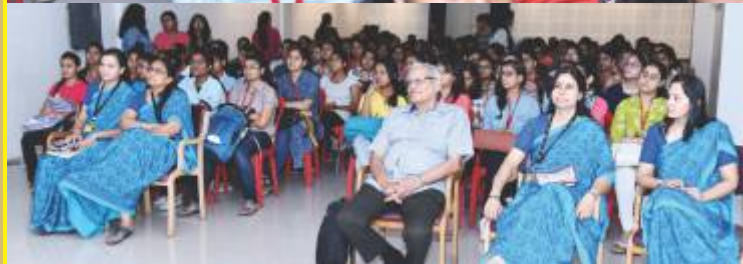
Dept. of English - 24 July 2018 (PG)